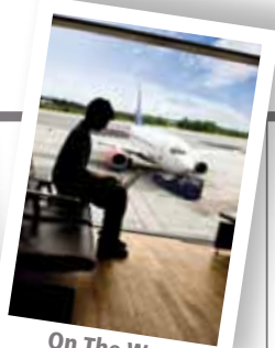
On The Way