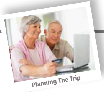
Planning The Trip