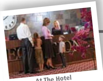
At The Hotel