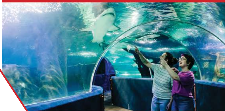
for Cleveland Aquarium