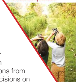
▼ b.a. Sweetie Candy Company