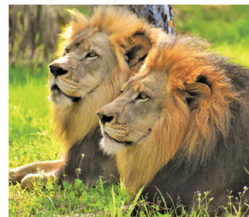
▲ Lion Country Safari ▼ Flagler Museum