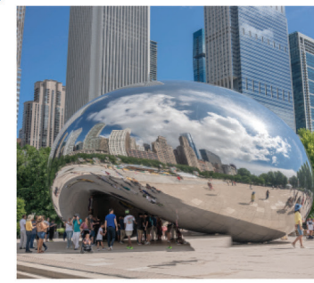
▼ Maggie Daley Park