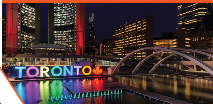
Toronto ▼ Whirlpool Jet Boat ▼ Hockey Hall of Fame

70% of visitors use travel brochures, visitor maps or guides for their trips; even with access to digital technology.*